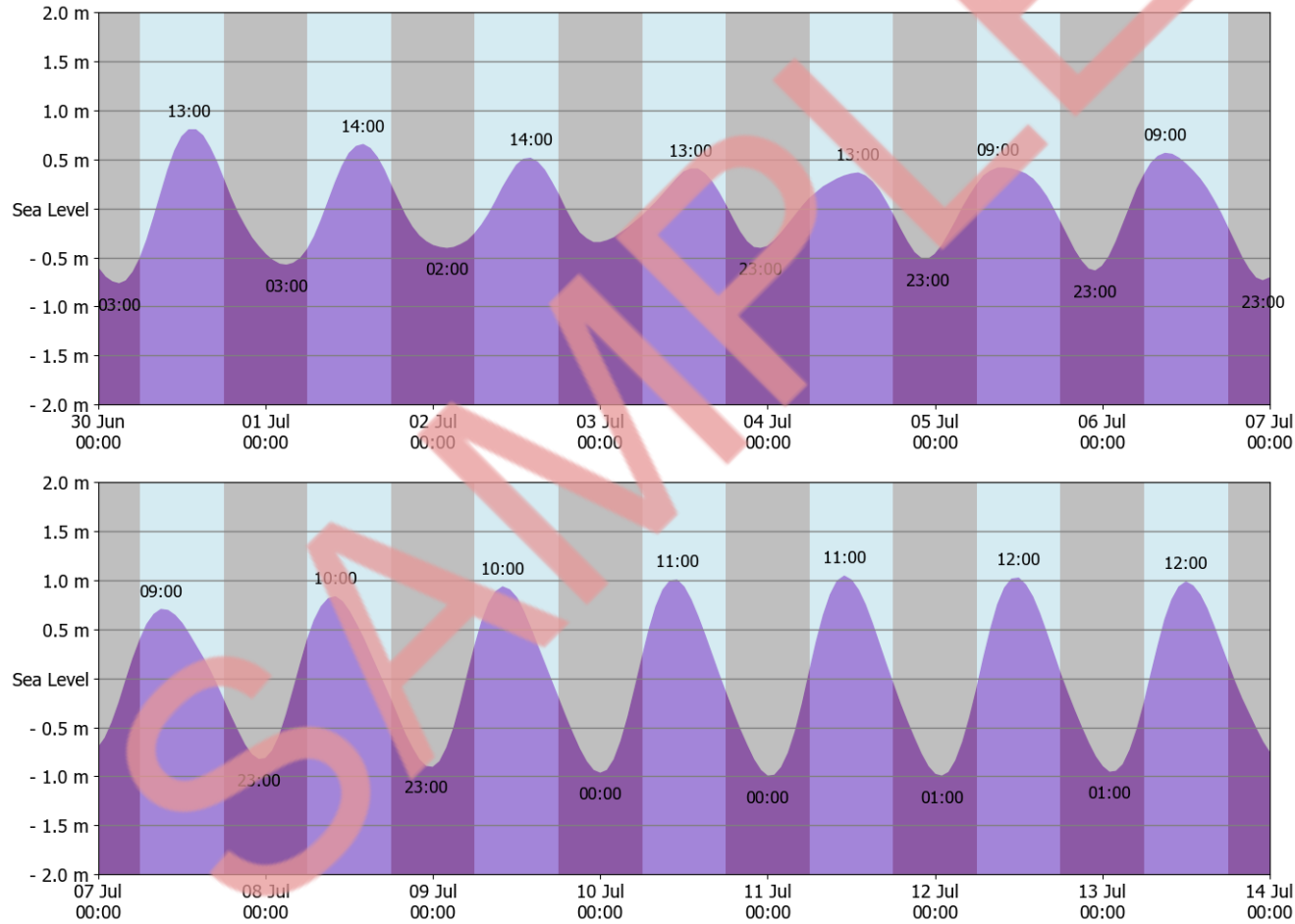
Tidal Charts in m